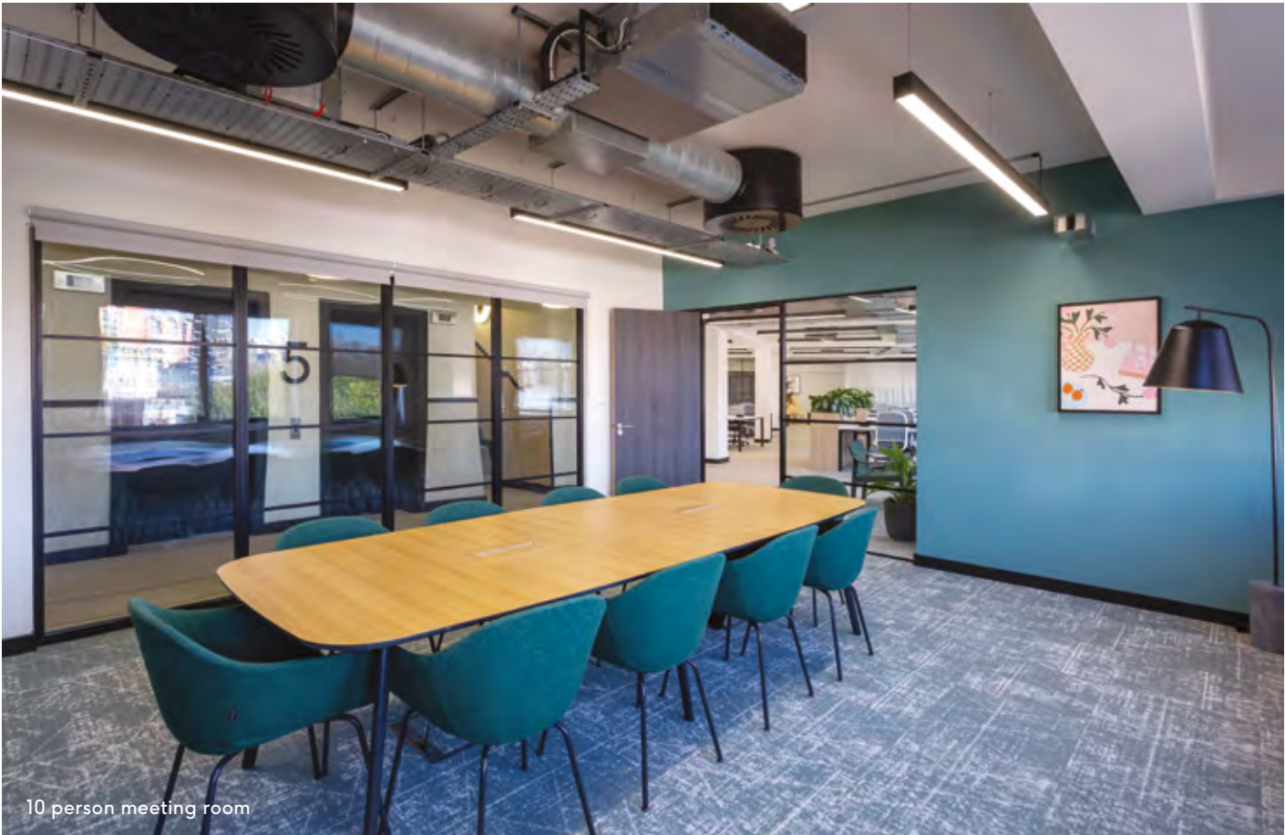
10 person meeting room