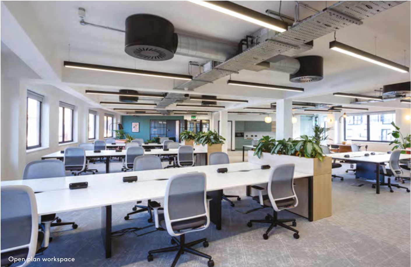
Open plan workspace