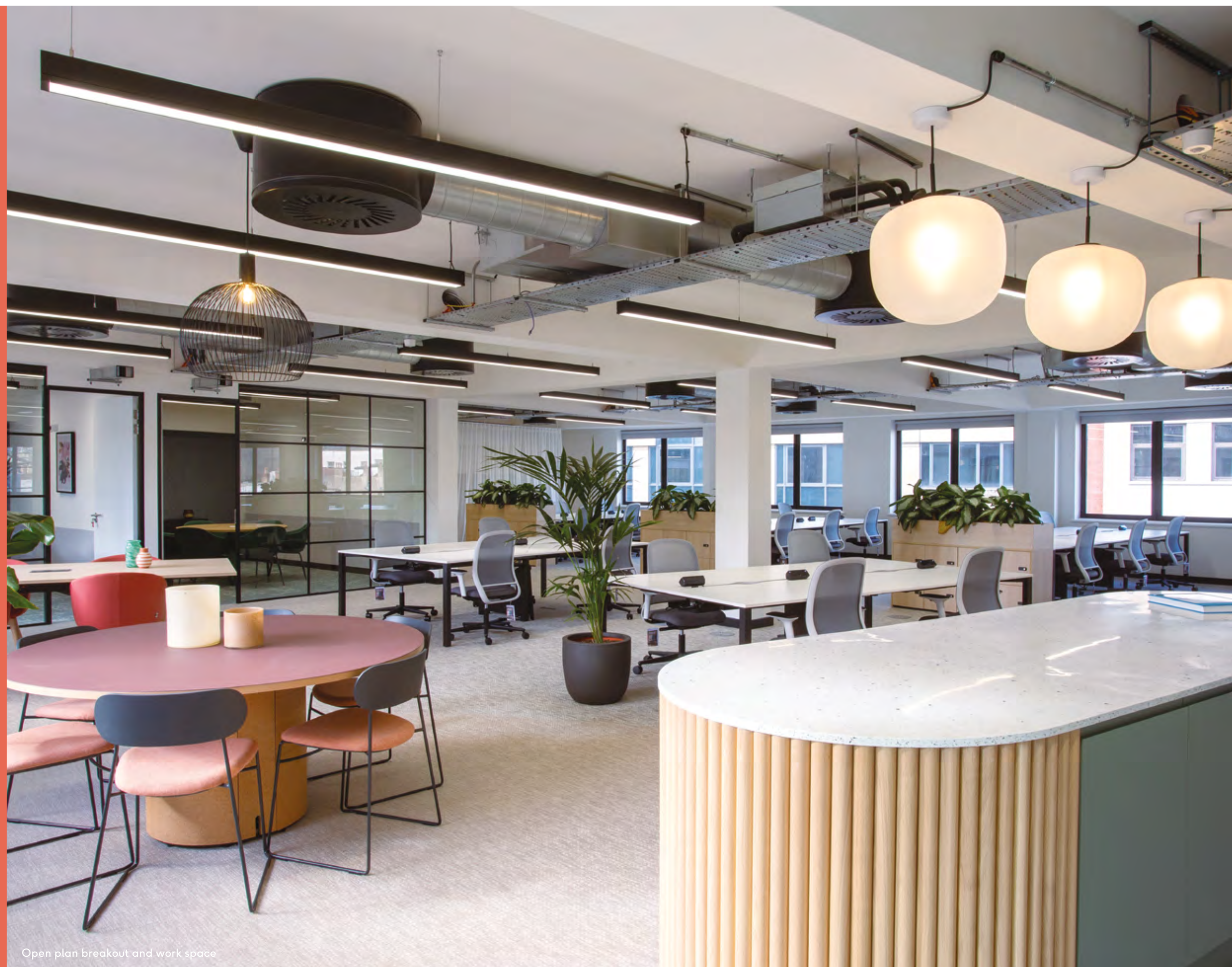
Open plan breakout and work space